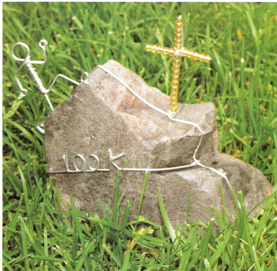
The Mont Royal 100K Trophy Rock